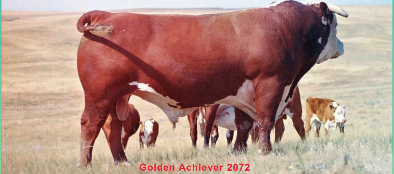
Golden Achiever 2072